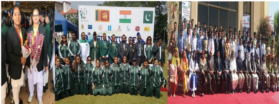
13th Asian Tug Of War International Sports Championship held at Sri Lanka Declamation contest held at C.C.Larkana