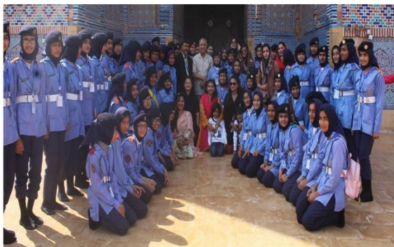
Educational Trip: Visit to Makkali