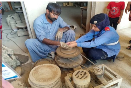
Educational Trip: Visit to Hala