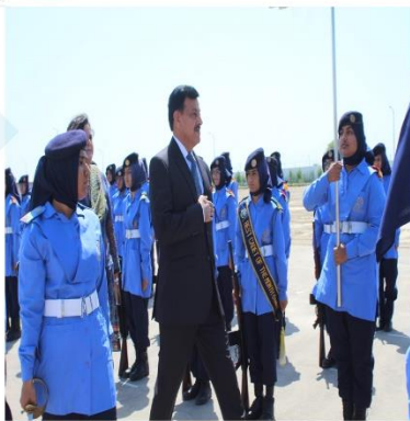
Visit of Principal C.C Larkana

In the running session, the college has arranged the visits to Hala, Makli Graveyard, Khenjhar Lake and IBA University Sukker.