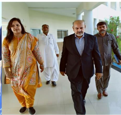
Visit of Deputy Commissioner Shaheed Benazirabad