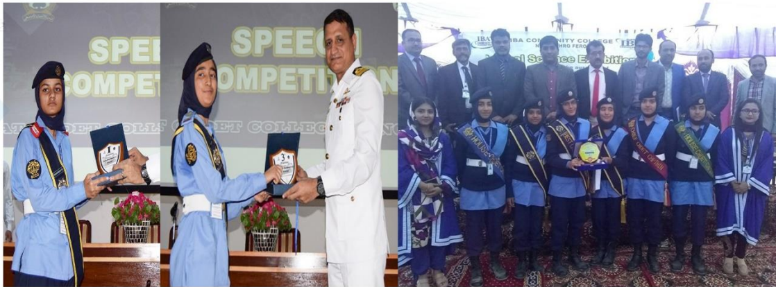
Bi-Lingual declamation contest held at C.C Sanghar Declamation contest B.I.S.E Hyderabad Board

To develop a healthy sense of competition among cadets, College arranges the cadets to participate in outdoor competitions of debates, Quiz, Science Models, Poster making, Essay Writing etc. on provincial as well as on National Level Competitions.